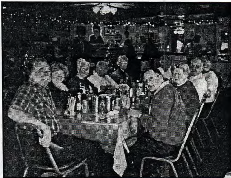
The gang at Peggy Sue's Diner.

a ride on his largest toy train. About 11:30 am we left the valley on two lane highway 247 headed east over the mountain toward Calico. We had lunch at Peggy Sue's Diner and proceeded on Ghost Town Road to Calico where we spent a few hours shopping and sightseeing. We arrived back in Lucerne Valley after dark and we all enjoyed a hearty dinner at a local Chinese Restaurant. Back at the Ace we collected pebbles from the driveway to be used as chips in the big poker game that lasted far into the night (about 9pm)! Sunday morning we got an early start for home and stopped for breakfast at the Summit Restaurant at the top of the Cajon Pass before heading back to reality. Thanks to everyone who donated toys. I hope we can do this again next year.